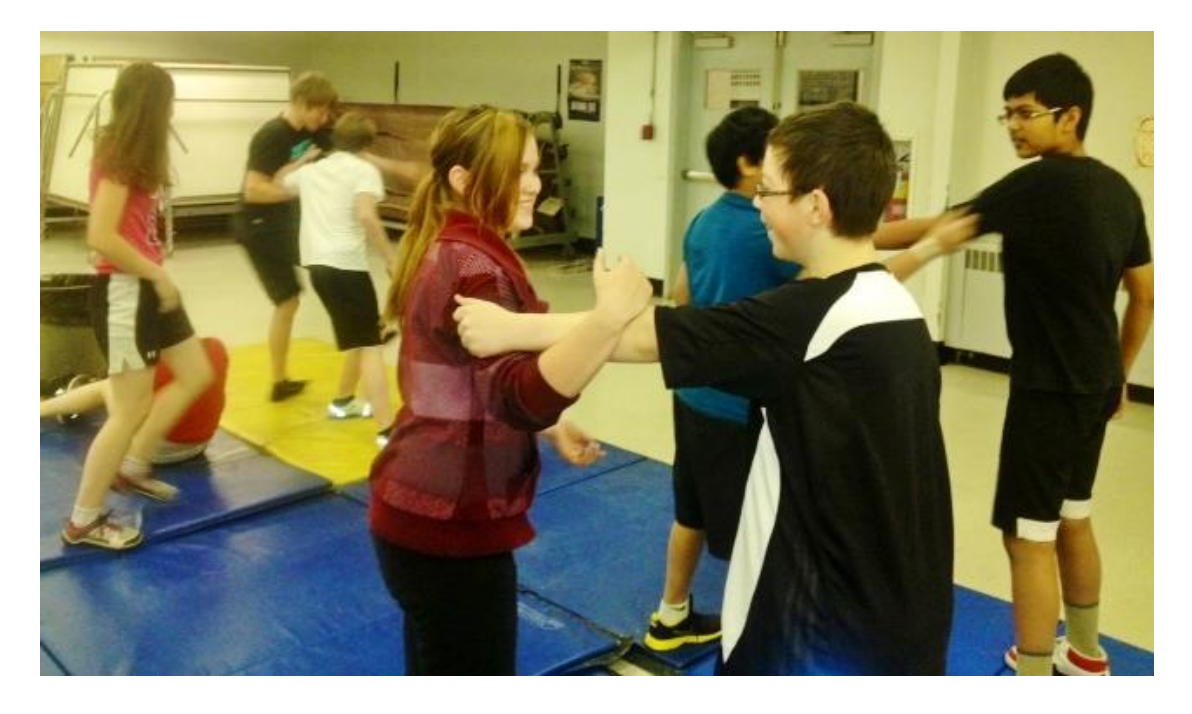
Approx.120 Students (Grade 8-10<sup>th</sup>) practiced Verbal-defense and basic Aiki-tai-jutsu techniques, in Whitehorse Schools, Oct-Dec.2012