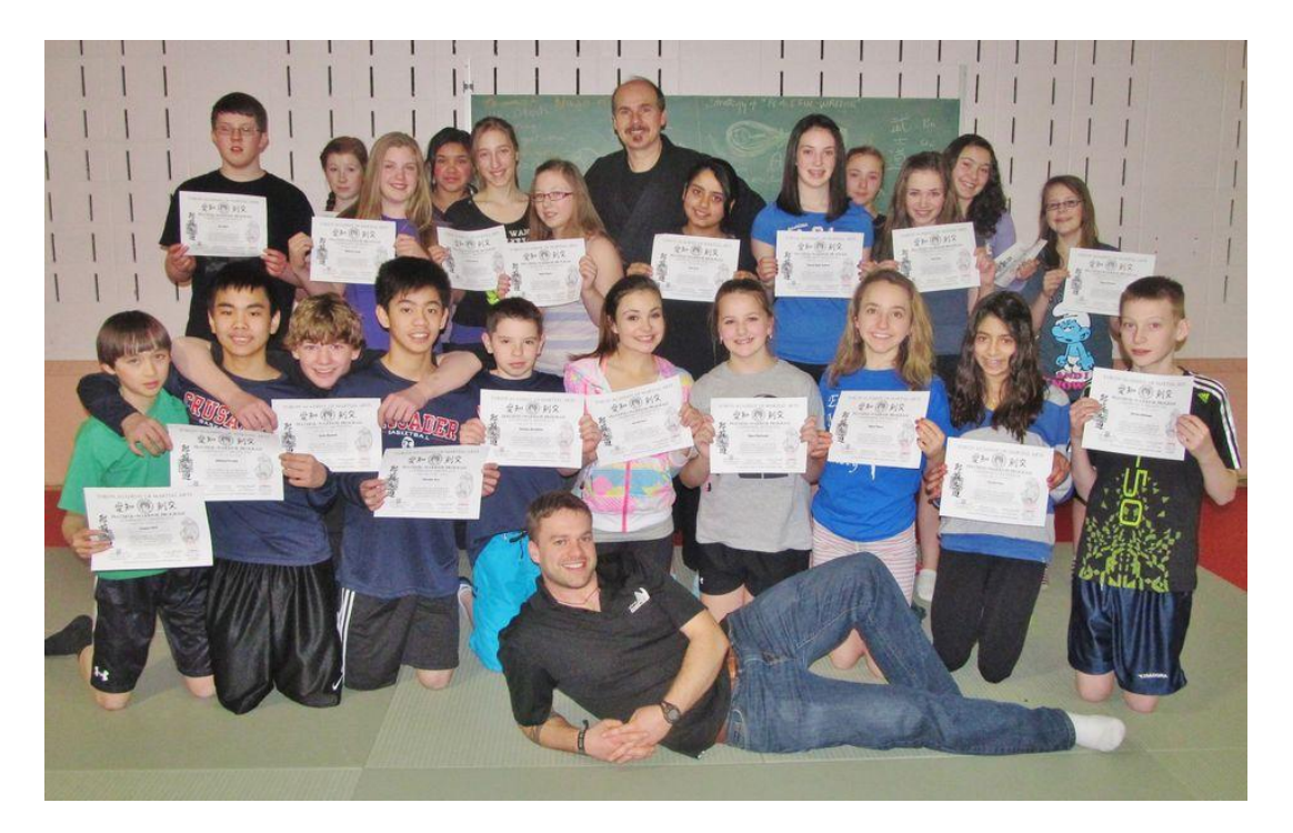
"Peaceful-warrior" Graduation at Vanier Secondary School, Whitehorse, Yukon, Feb.2013