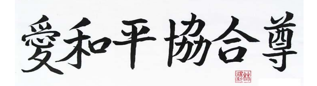
Calligraphy: "Respect - Unity - Peace - Love"